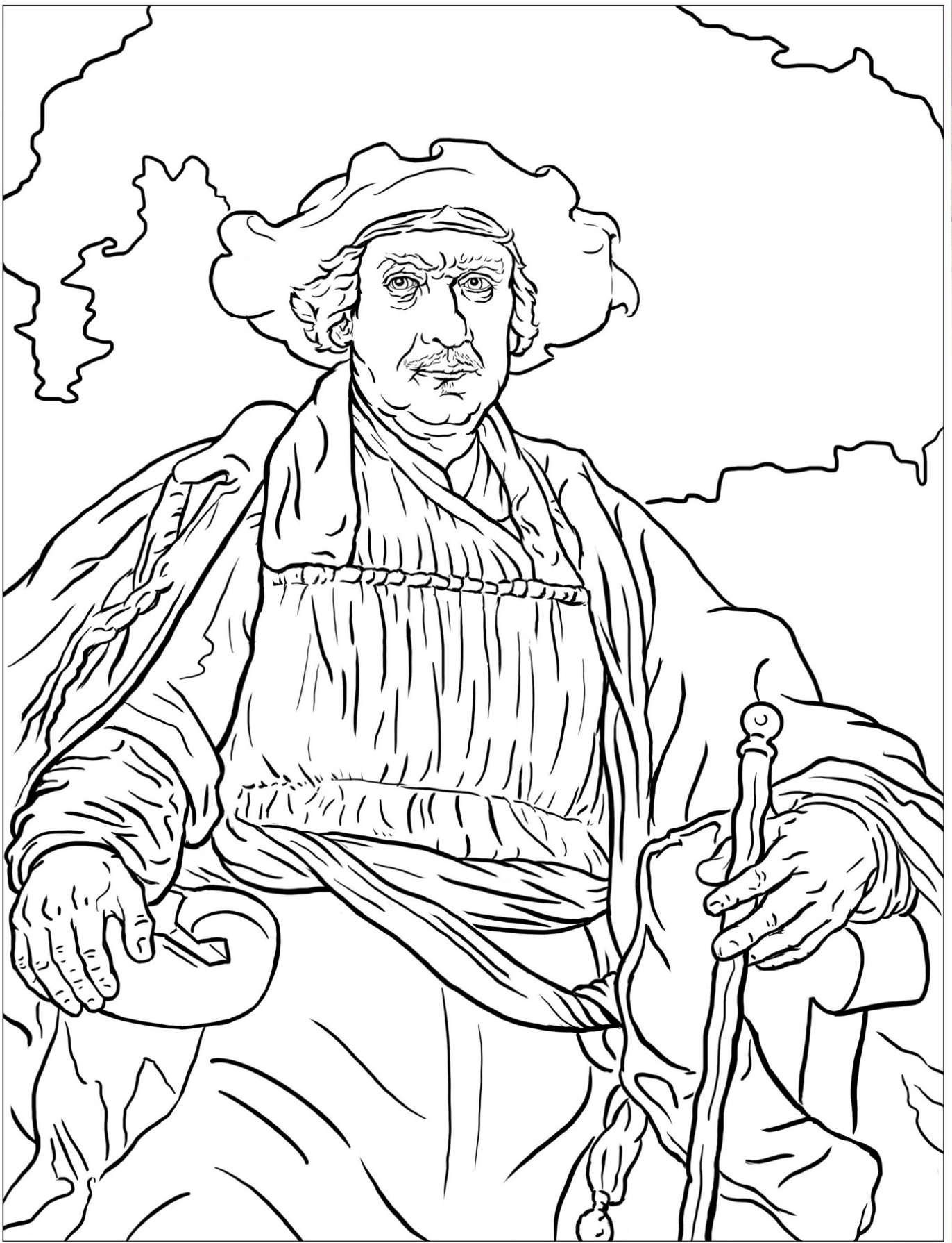
Rembrandt van Rijn (Dutch, 1606–1669)